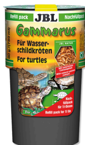
JBL Gammarus Refill pack Treats for turtles from 10 to 50 cm