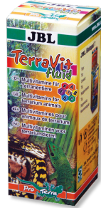
JBL TerraVit fluid Vitamins and trace elements for terrarium animals