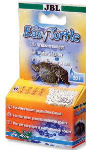
JBL EasyTurtle Special granulate to remove odours