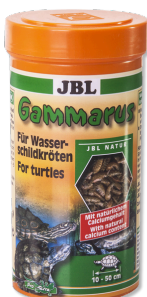
JBL Gammarus Treats for turtles from 10 to 50 cm