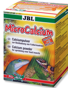
JBL MicroCalcium Mineral supplementary food for all reptiles