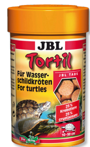
JBL Tortil Food tablets for turtles and pond terrapins