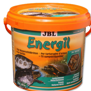
JBL Energil Main food for turtles and pond terrapins