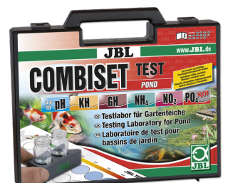
JBL Test Combi Set Pond The most important water tests for garden ponds