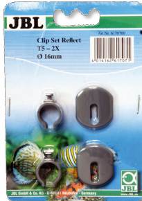
JBL SOLAR REFLECT Clip Set Holder for fluorescent tubes