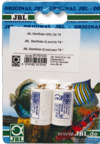
JBL Start Solar Starter for T8 fluorescent tubes