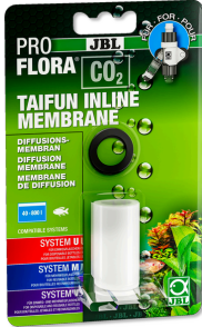
JBL PROFLORA CO2 TAIFUN INLINE MEMBRANE

Replacement diaphragm for CO2 TAIFUN INLINE diffuser