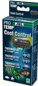
JBL PROTEMP CoolControl Thermostat to regulate cooling fans