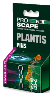
JBL PROSCAPE PLANTIS PINS Plant pegs for the anchoring of aquarium plants