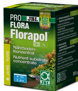
JBL PROFLORA Florapol Long-term nutrient substrate concentrate