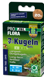
JBL PROFLORA 7 + 13 Balls Root fertiliser for freshwater aquariums