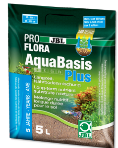
JBL PROFLORA AquaBasis plus Long-lasting nutrient substrate f. freshwater aquarium