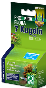
JBL PROFLORA 7 Balls Root fertiliser for freshwater tanks (7 fertil. balls)