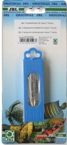
JBL Aqua-T Handy spare blade, 5x Spare blades for Aqua-T Handy