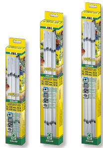
JBL SOLAR Reflect T5/ T8 - 895-1500 mm Reflector panel for fluorescent tube