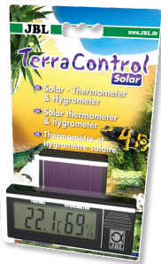
JBL TerraControl Solar Solar-powered thermometer + hygrometer for terrariums