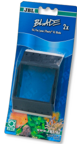
JBL BLADE for FLOATY L/XL