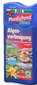
JBL PhosEX Pond Direct Phosphate remover for ponds