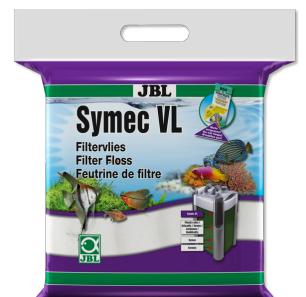
JBL Symec VL Filter wool fleece to remove water cloudiness