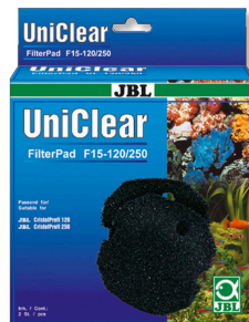
JBL FilterPad F15 Coarse foam pad for aquarium filter CristalProfi