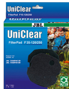
JBL FilterPad F35 Fine foam pad for aquarium filter CristalProfi