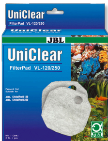
JBL FilterPad VL Cotton fleece for CristalProfi aquarium filters