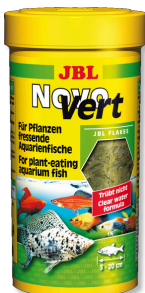
JBL NovoVert Main food flakes for plant-eating fish