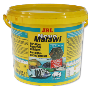
JBL NovoMalawi Main food flakes for algae-eating cichlids