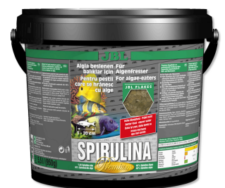
JBL Spirulina Premium main food for algae-eating aquarium fish