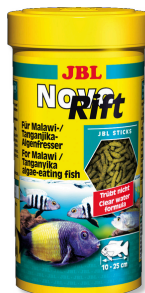
JBL NovoRift Main food sticks for grazing cichlids