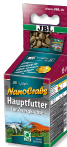
JBL NanoCrabs Main food for dwarf crayfish