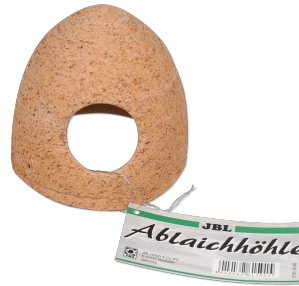
JBL Ceramic spawning cave Ceramic cave for freshwater aquariums