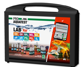
JBL PROAQUATEST LAB Koi Professional test case for koi and garden ponds