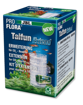
JBL PROFLORA Taifun Extend Extension for CO2 highperformance diffuser