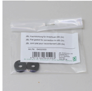
ProFlora u95 flat gasket