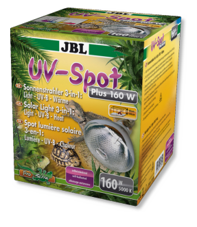
JBL UV-Spot plus UV spotlight with daylight spectrum for terrariums