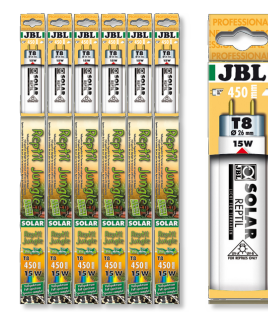
JBL SOLAR REPTIL JUNGLE T8 T8 terrarium fluorescent tube for rainforest animals