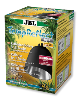
JBL TempReflect light Reflector screen for energysaving lamps