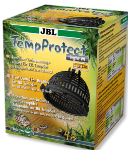
JBL TempProtect light Reptile thermal burn protection for JBL TempSets