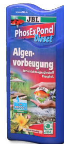
JBL PhosEX Pond Direct Phosphate remover for ponds