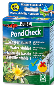
JBL PondCheck Quick test to determine the pH and KH values