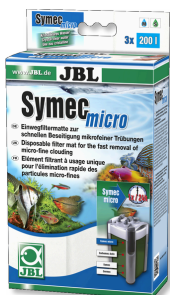
JBL Symec micro Microfibre fleece against water cloudiness