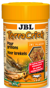
JBL TerraCrick Complete food for feeder insects