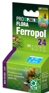
JBL PROFLORA Ferropol 24

Plant fertiliser for freshwater aquariums