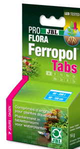
JBL PROFLORA Ferropol Tabs

Daily plant fertiliser for freshwater aquariums