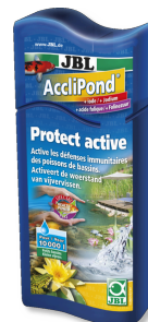
JBL AccliPond Water conditioner for ponds