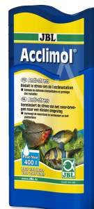
JBL Acclimol Water conditioner for acclimatisation