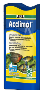
JBL Acclimol Water conditioner for acclimatisation