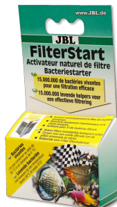
JBL FilterStart Bacteria for the activation of filters