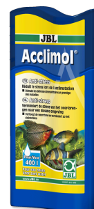
JBL Acclimol Water conditioner for acclimatisation