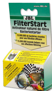
JBL FilterStart Bacteria for the activation of filters