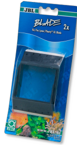
JBL BLADE for FLOATY L/XL