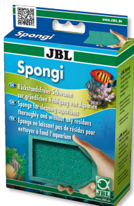
JBL Spongi Cleaning sponge for aquariums and terrariums