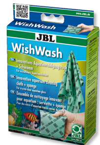
JBL WishWash Cleaning cloth and sponge