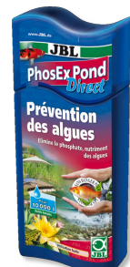
JBL PhosEX Pond Direct Phosphate remover for ponds