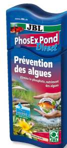
JBL PhosEX Pond Direct Phosphate remover for ponds