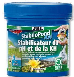
JBL StabliPond KH pH balancer for garden ponds