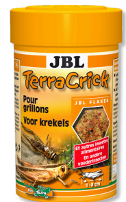
JBL TerraCrick Complete food for feeder insects