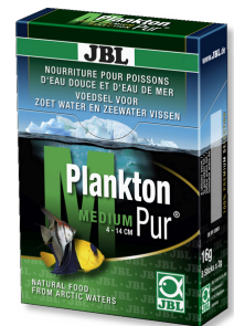
JBL PlanktonPur MEDIUM Treats for large aquarium fish