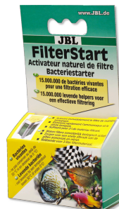
JBL FilterStart Bacteria for the activation of filters