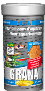
JBL Grana Premium main food granulate for small aquarium fish