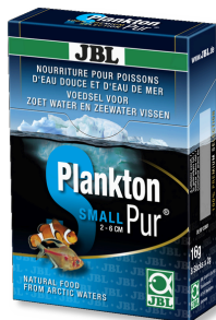
JBL PlanktonPur SMALL