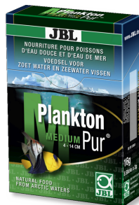
JBL PlanktonPur MEDIUM