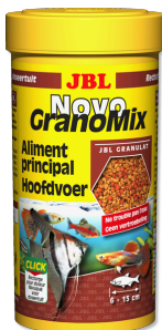
JBL NovoGranoMix Main food for medium-sized and large aquarium fish