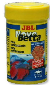
JBL NovoBetta Complete food for labyrinth fish, e.g. fighting fish