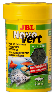
JBL NovoVert Main food flakes for plant-eating fish