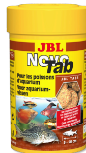
JBL NovoTab Main food tablets for all aquarium fish