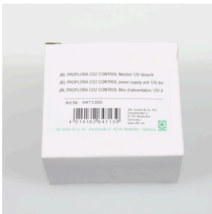
JBL PF CO2 CONTROL power supply unit 12V