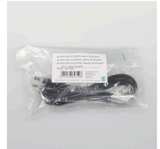
JBL PF CO2 CONTROL cable for VALVE