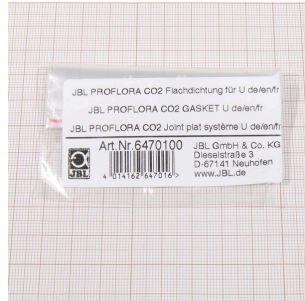
JBL PF CO2 flat gasket for u