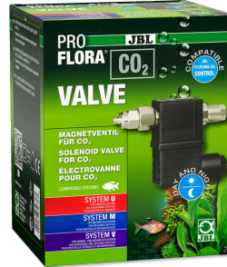
JBL PROFLORA CO2 VALVE CO2 solenoid valve for regulated CO2 addition