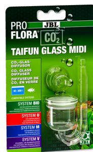
JBL PROFLORA CO2 TAIFUN GLASS Glass CO2 diffuser for freshwater tanks from 40-300 l