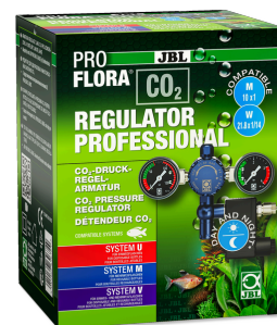
JBL PROFLORA CO2 REGULATOR PROFESSIONAL Pressure regulator with 2 displays & valve for CO2