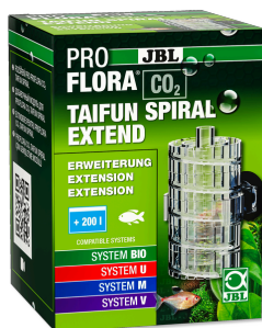
JBL PROFLORA CO2 TAIFUN SPIRAL EXTEND Extension for JBL PROFLORA CO2 TAIFUN SPIRAL 5 / 10