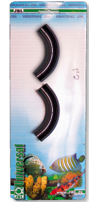
JBL AntiKink Anti-kink protection for hoses