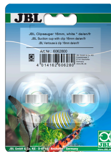
JBL suction cup with clip, 16 mm Rubber suction pads for objects of 16 mm in diameter