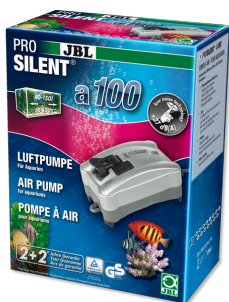
JBL PROSILENT a100 Air pump for fresh and saltwater aquariums