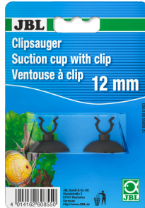
JBL suction cup with clip, 12 mm Rubber suction pads with clips for objects with 12 mm