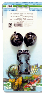
JBL suction cup with clip, 23 mm Rubber suction pads for objects of 23-28 mm in diameter