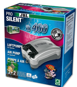
JBL PROSILENT a400 Air pump for fresh and saltwater aquariums