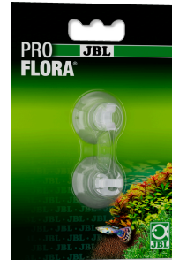
JBL suction cup with clip, 6 mm Transp. suction cups + clips for objects 6mm approx.