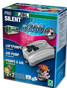
JBL PROSILENT a200 Air pump for fresh and saltwater aquariums