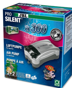
JBL PROSILENT a300 Air pump for fresh and saltwater aquariums