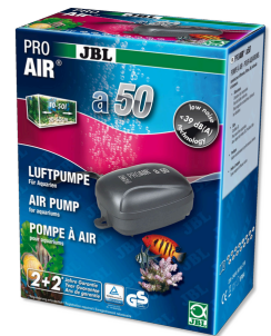
JBL PROAIR a50 Air pump for aquariums