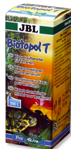
JBL Biotopol T Water conditioner for terrariums