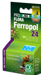
JBL PROFLORA Ferropol 24

Plant fertiliser for freshwater aquariums