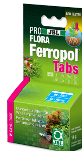
JBL PROFLORA Ferropol Tabs

Daily plant fertiliser for freshwater aquariums