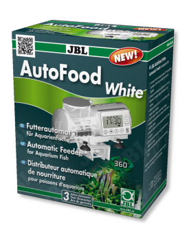
JBL AutoFood WHITE White automatic feeder for aquarium fish