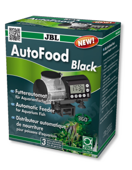
JBL AutoFood BLACK Black automatic feeder for aquarium fish