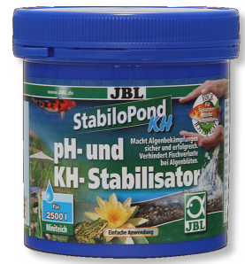
JBL StabiloPond KH pH balancer for garden ponds