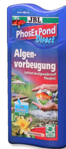
JBL PhosEX Pond Direct Phosphate remover for ponds