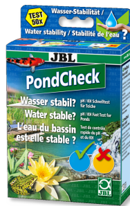
JBL PondCheck Quick test to determine the pH and KH values