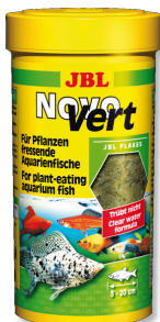
JBL NovoVert Main food flakes for plant-eating fish