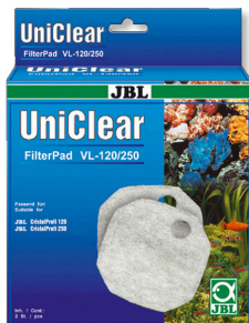
JBL FilterPad VL Cotton fleece for CristalProfi aquarium filters