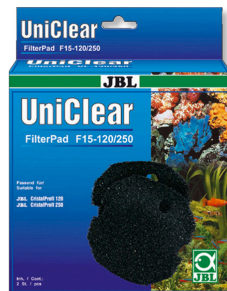
JBL FilterPad F15 Coarse foam pad for aquarium filter CristalProfi