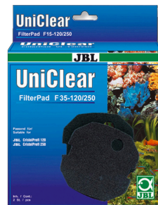
JBL FilterPad F35 Fine foam pad for aquarium filter CristalProfi