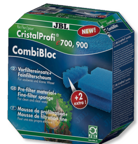
JBL CombiBloc CristalProfi e Pre-filter pads and filter foam for CristalProfi e