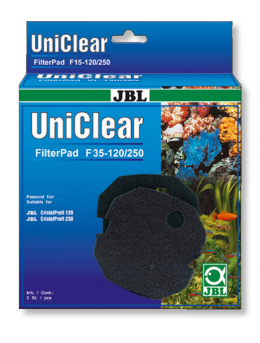
JBL FilterPad F35 Fine foam pad for aquarium filter CristalProfi