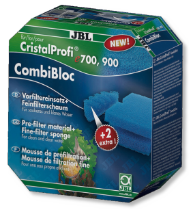
JBL CombiBloc CristalProfi e Pre-filter pads and filter foam for CristalProfi e