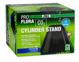
JBL PROFLORA CO2 CYLINDER STAND

Wall mount for CO2 cylinders with safety bracket