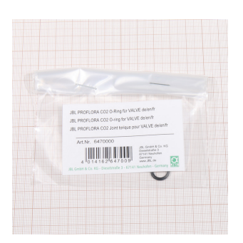
JBL PF CO2 O-ring for VALVE