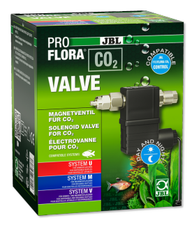
JBL PROFLORA CO2 VALVE

CO2 solenoid valve for regulated CO2 addition